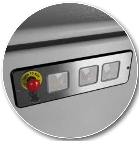
On-board control panel