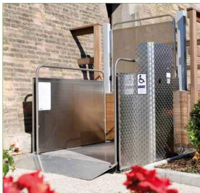
Stainless steel version (on option)