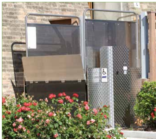
Stainless steel version (on option)