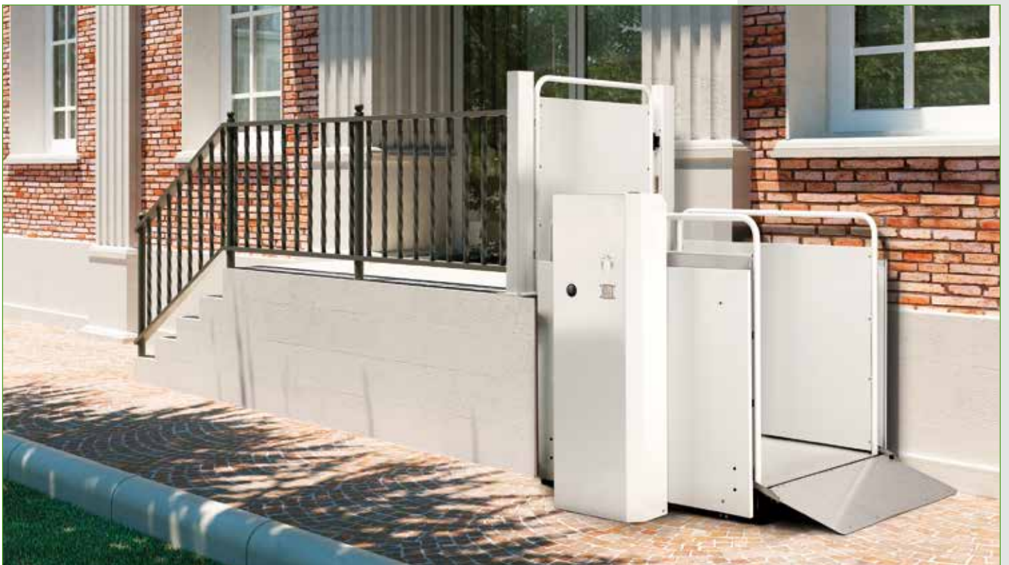
Standard version in RAL 7040 painted steel