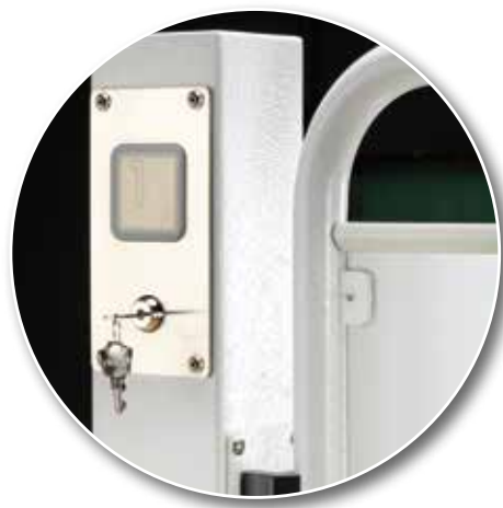
Floor control panel