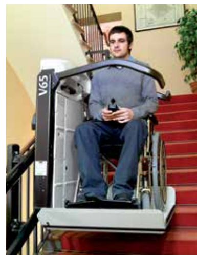
The V65 stairlift ensures comfort and safety over any kind of path