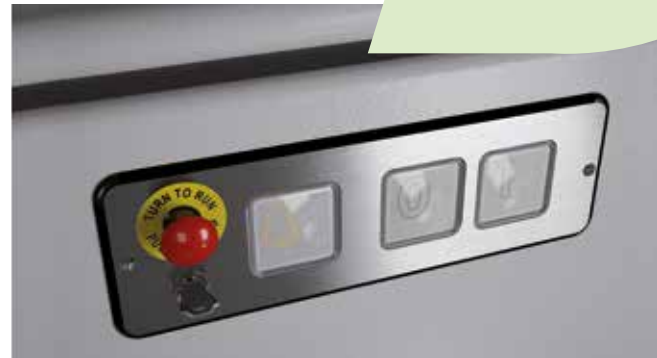
The on-board and floor control panels are equipped with keys and can be used easily.